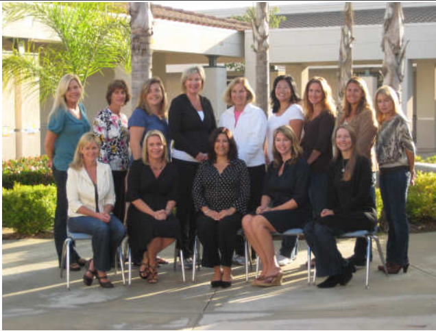
PTA Board Members for 2009-2010